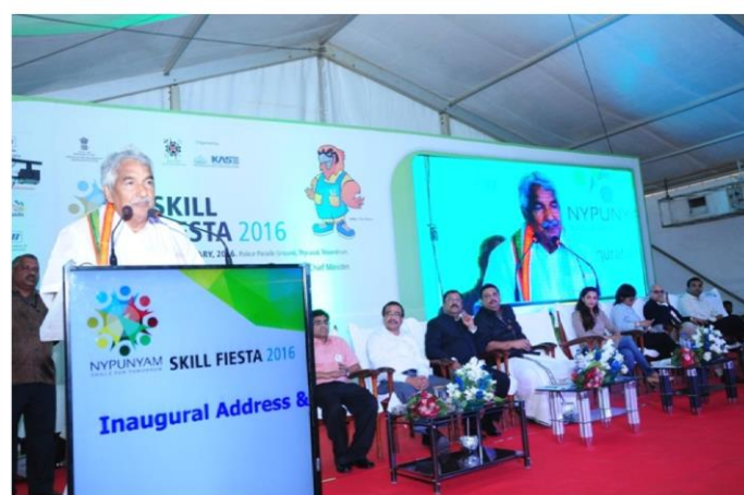
Shri Oommen Chandy, Chief Minister, Government of Kerala during the inaugural ceremony