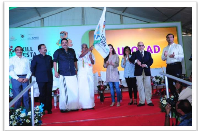
Inauguration of the Skill Fiesta & (below) Skill competitions at the venue