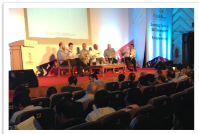
Master-class for competition experts (top pic); Seminar in progress at India Skills Week

The session was attended by more than 190 competition organisers and experts, state skill mission representatives, and other stakeholders interested in skills competitions.