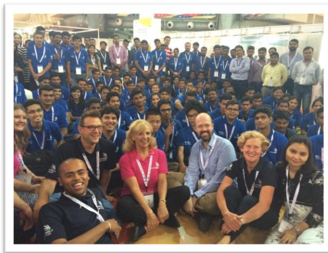
WorldSkills UK skill-champions with WorldSkills India competitors at Pragati Maidan

WorldSkills UK and WorldSkills India will continue to work together to shape skills competitions experiences for young people. For more information on WorldSkills UK, please visit worldskillsuk.org