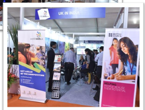
Bird's eye view of the India Skills Week (top pic); UK Expo at the event