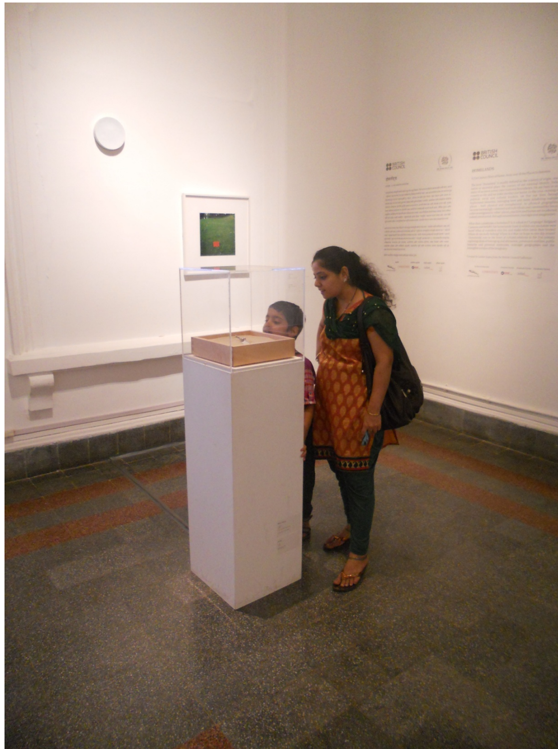
+ and - , by Mona Hatoum.