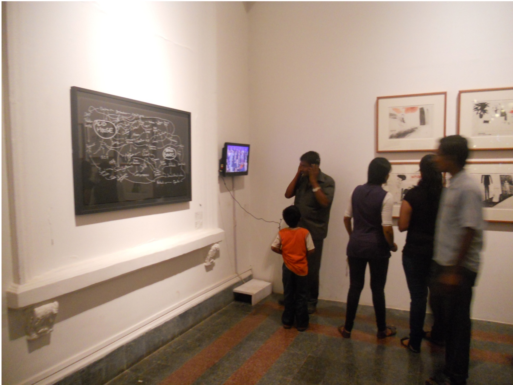
Visitors enjoying the exhibition.