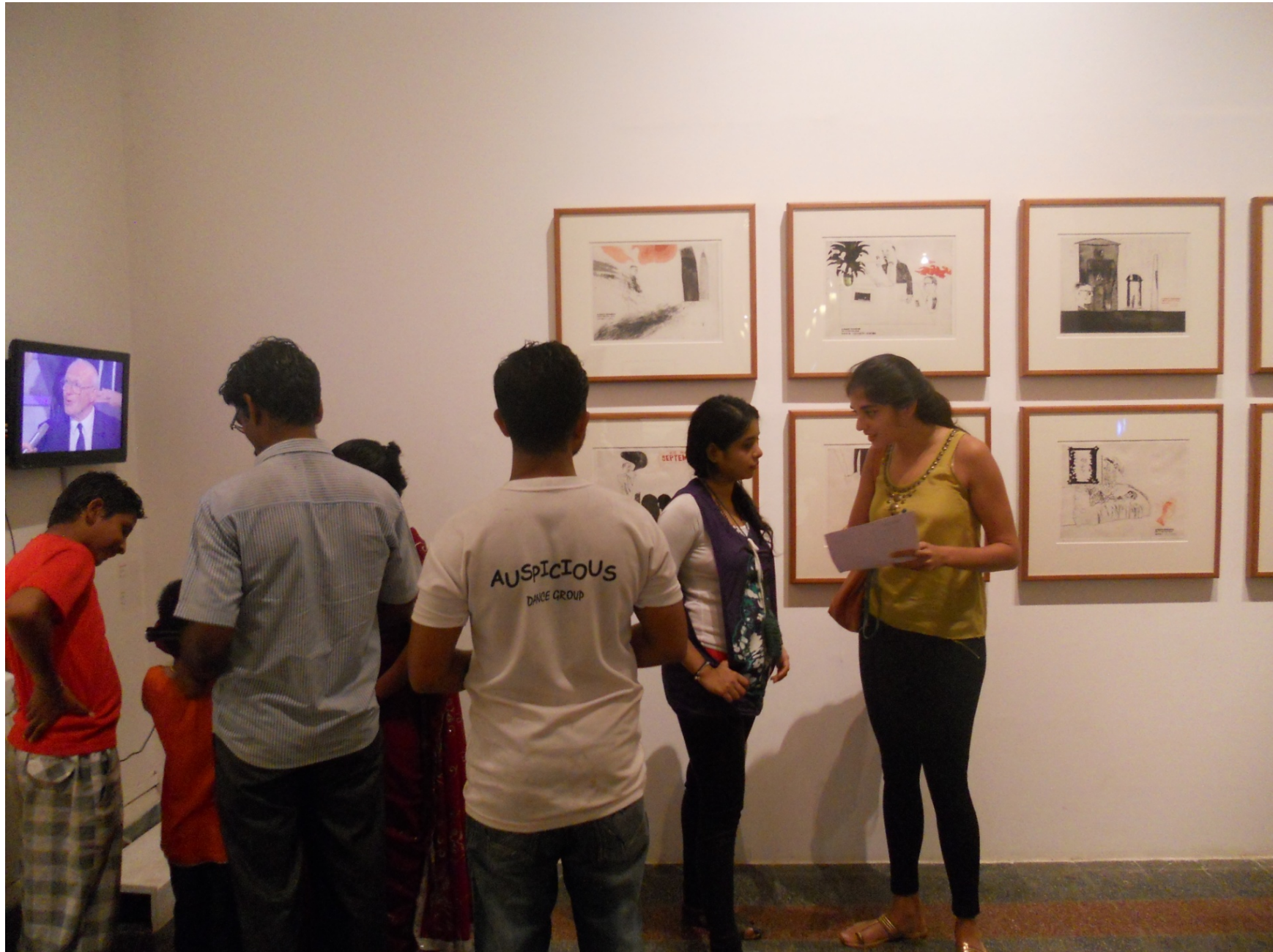
Visitors enjoying works by David Hockney and Jeremy Deller.