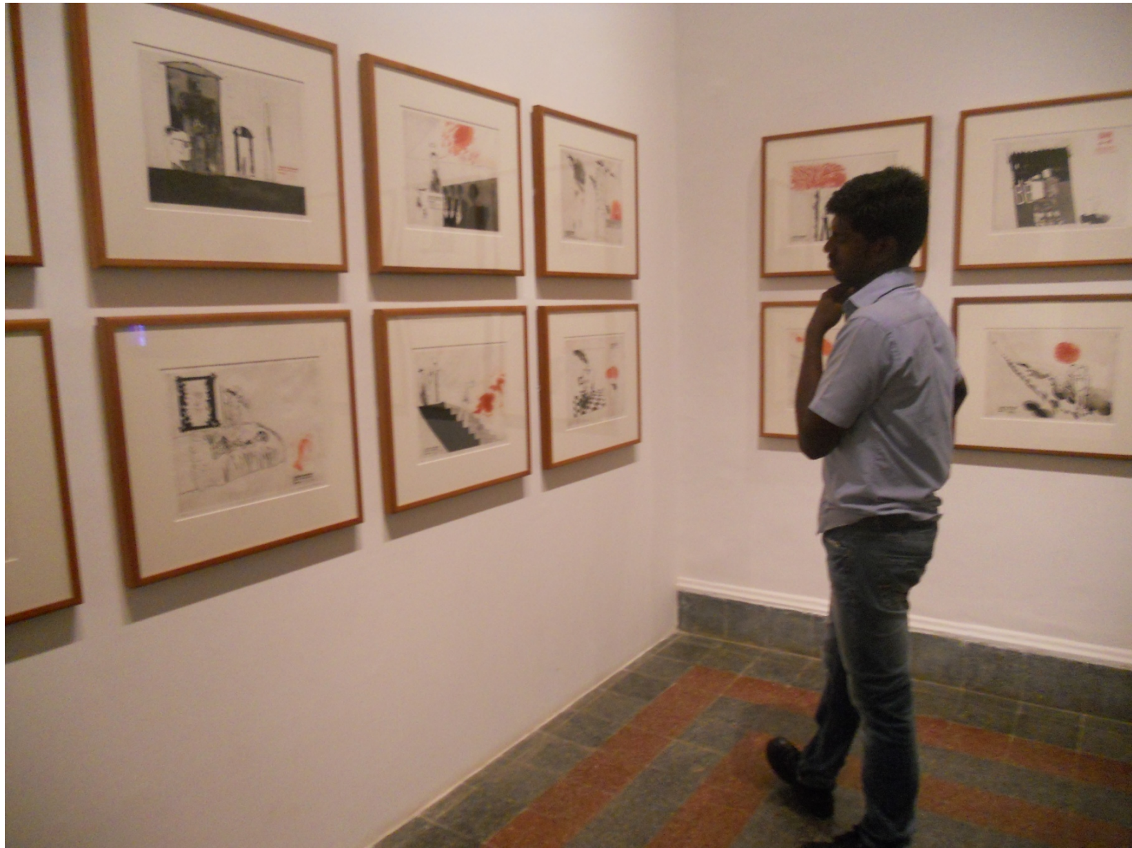
A visitor enjoys the work by David Hockney.