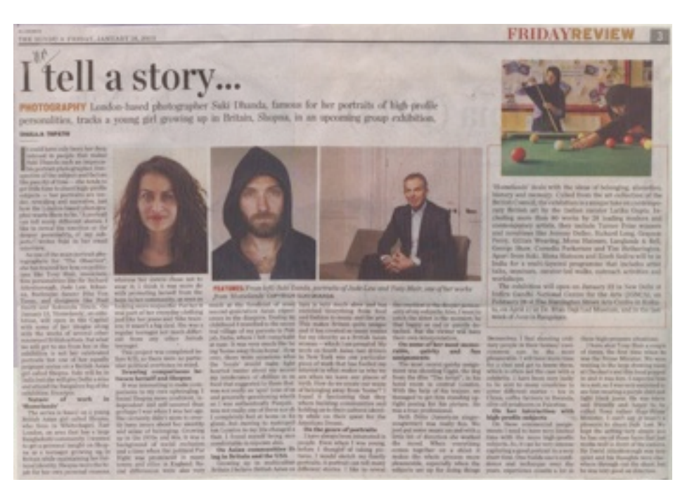
The Hindu, 18th Jan