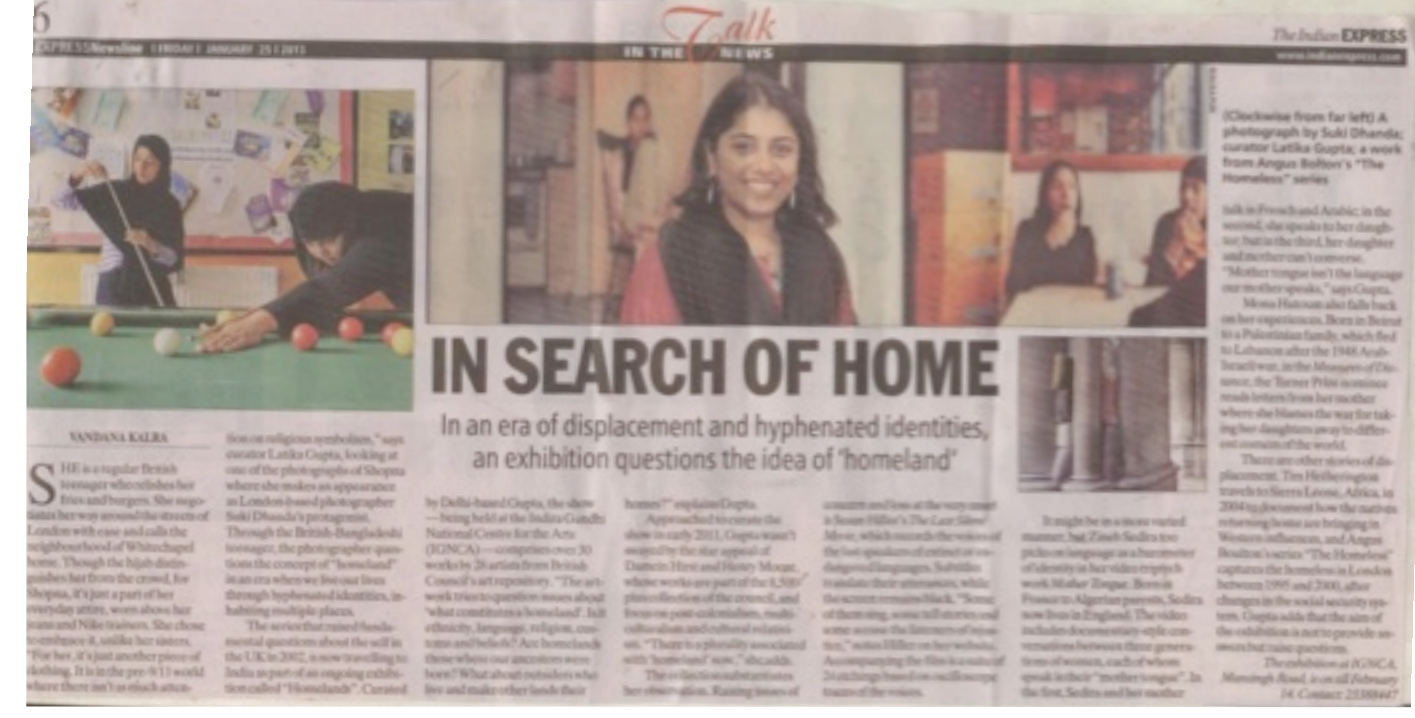
Indian Express, 25th Jan