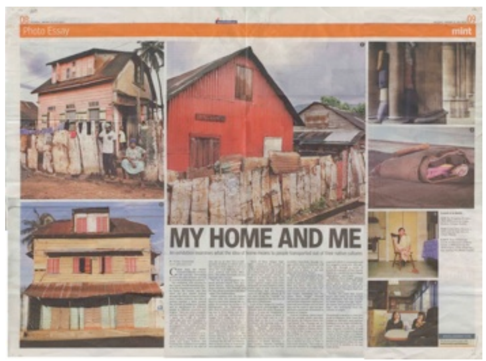
Mint Lounge, 26th Jan