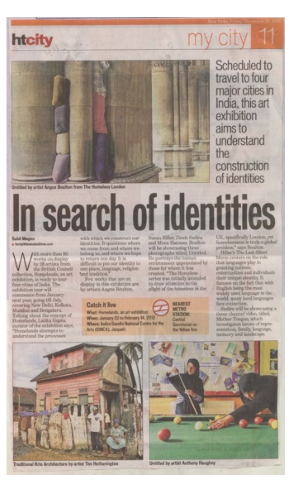
HT City, 21st Jan