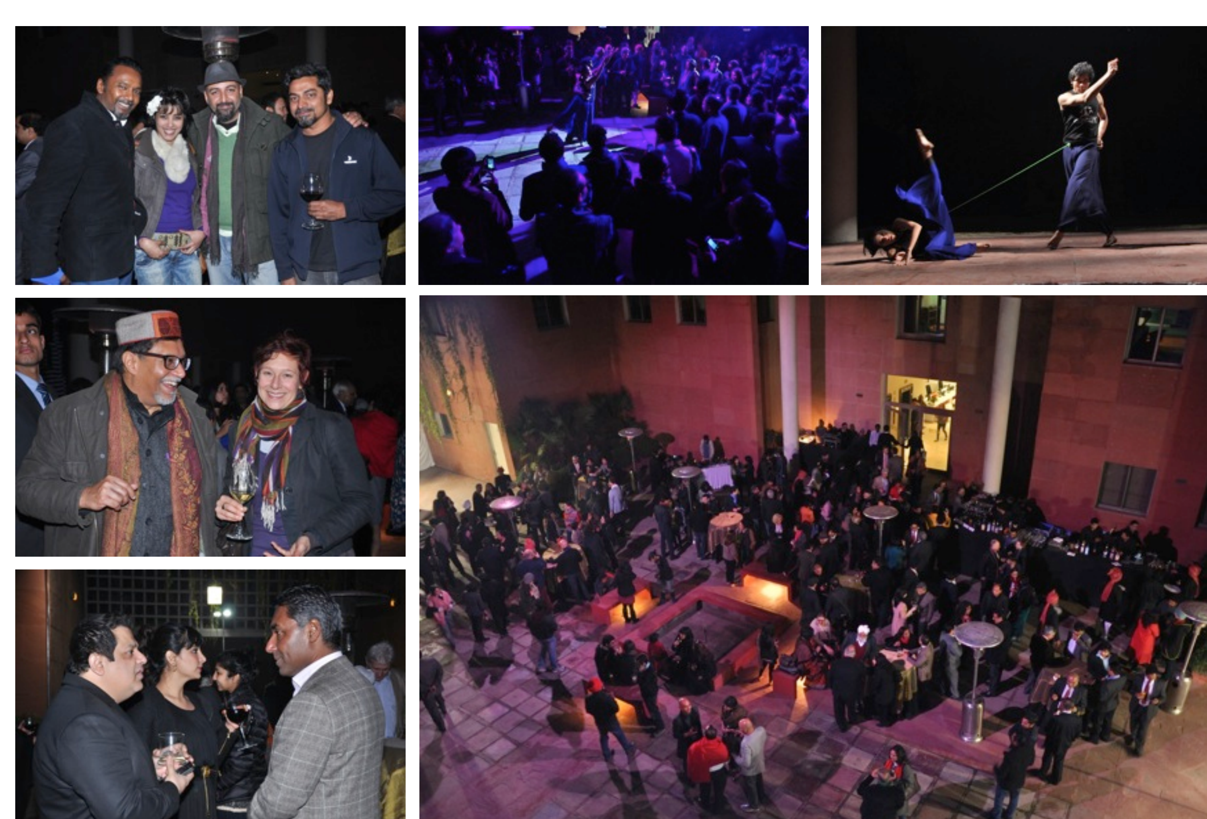
Jan 22: Preview reception at Char Bagh. Attendance 420.