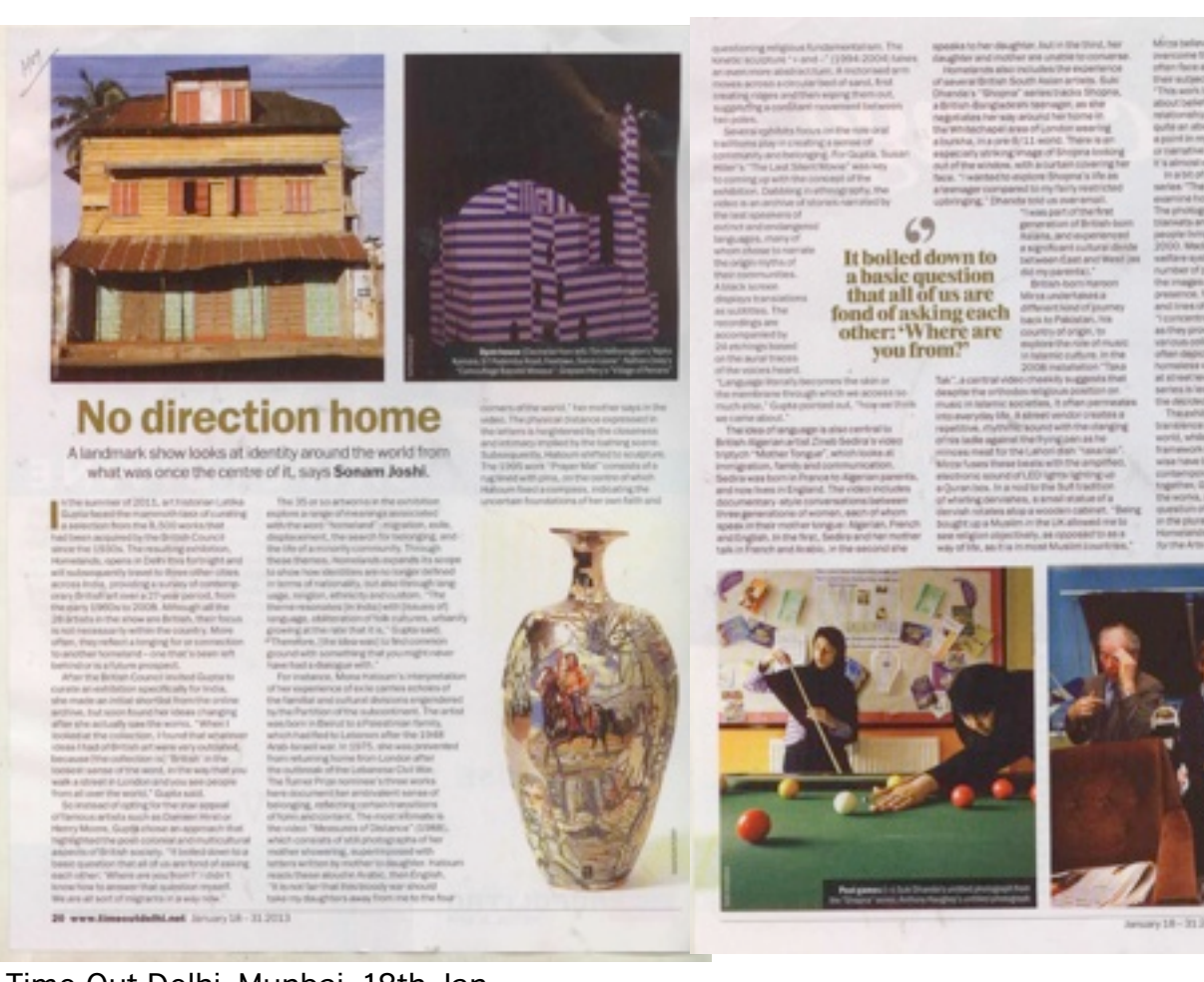
Time Out Delhi, Munbai, 18th Jan