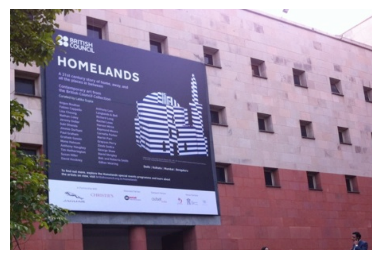
Jan 22: Public Preview at IGNCA. Attendance approx 300